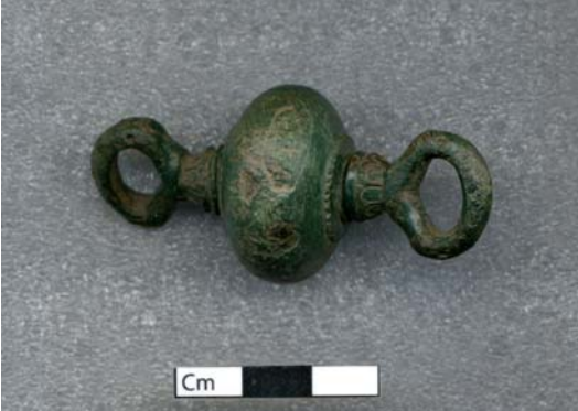
TT.157/14 16th-17th Century Hunting leash fitting, Pitlochry, Perth & Kinross

This object is an unusual and rare survival of what must have been a common object in early modern hunting and was used to connect the controlling hand of the huntsman to the leashes of the dogs. This type of leash is for a 'scent hound', used to track boar or deer which would then be ran down by a free running pack of dogs. This style of hunting gradually fell from use as boar became extinct and fox hunting developed, but scent hounds could still find other uses such as tracking thieves or fugitives. Allocated to Perth Museum & Art Gallery.